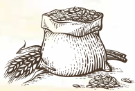
Classic Bourbon Whiskey

With its radiant topaz hue and the scent left in the air, ALTON BOURBON immediately presents itself as a pleasant and stimulating experience. Elegantly floral while complacently freezing, the aromas of vanilla, caramel, fondant, and coconut beckon the nose, followed by a smoky, complex permeation of the palate that results in a clean, refined, and rich full finish. Predominantly corn with a touch of rye and serious aging behind it, ALTON BOURBON binds together quintessential colonial craftsmanship with the best techniques in new age distillation deserving the redefinition of American Whiskey while innovating it to a high level of quality.