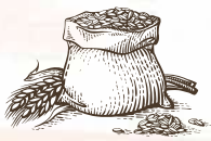
New-Age Rye Whiskey

In our case, in addition to the use of the local high quality winter rye and the fantastic characteristics of the Catskill water, the sour mash and adding a small amount of malted rye have translated our desired goal into pleasant reality.